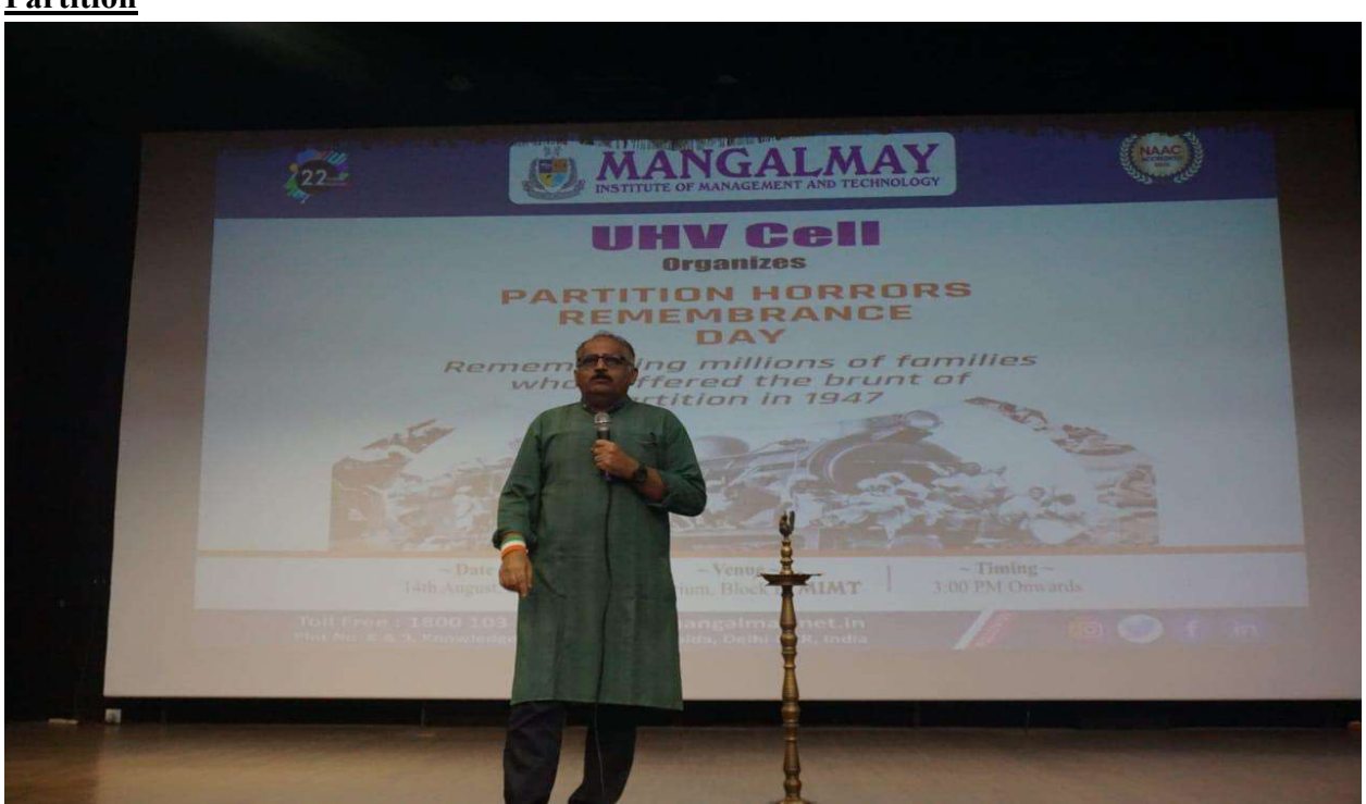
Students were participating in the Celebration