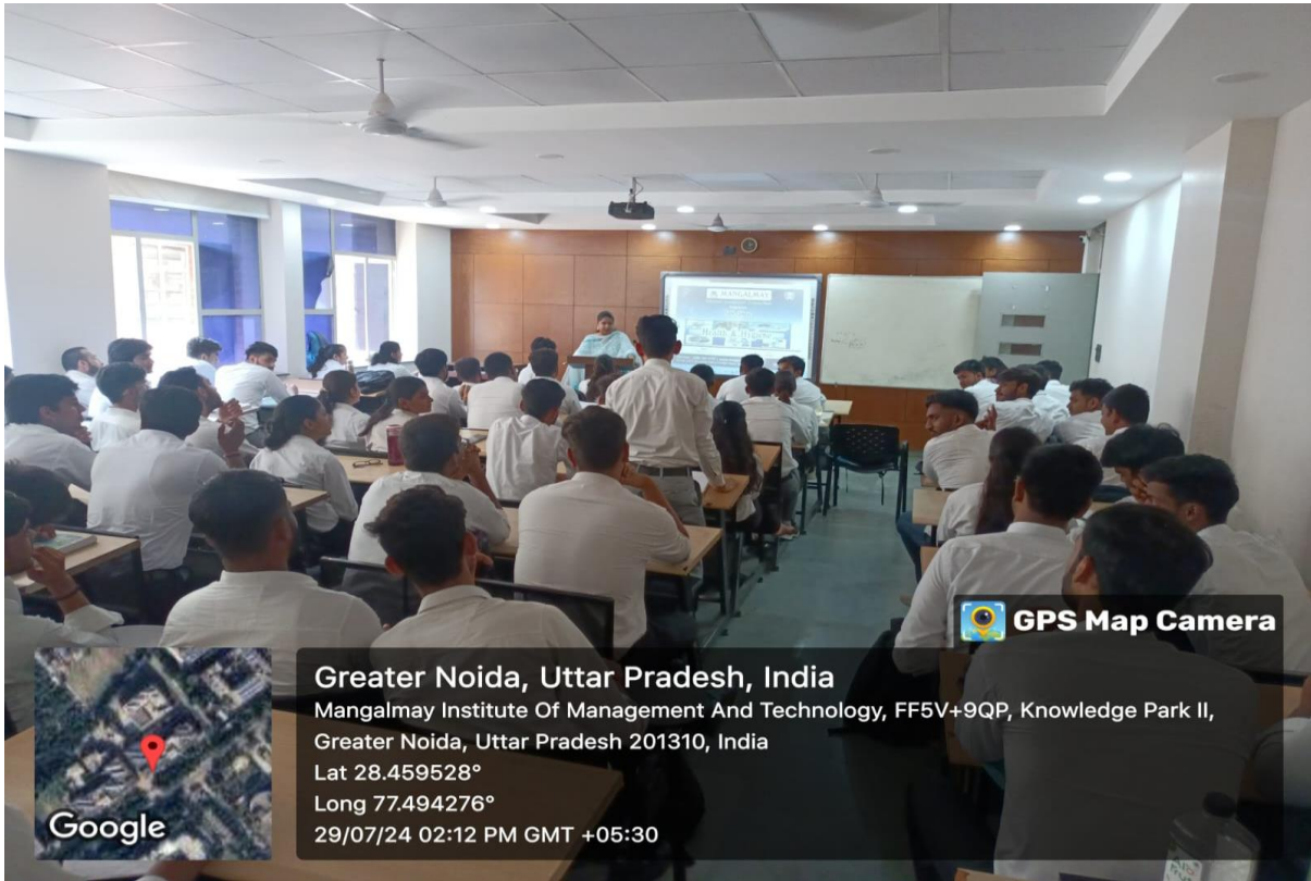
Pic 4: Expert interacting with students during session.