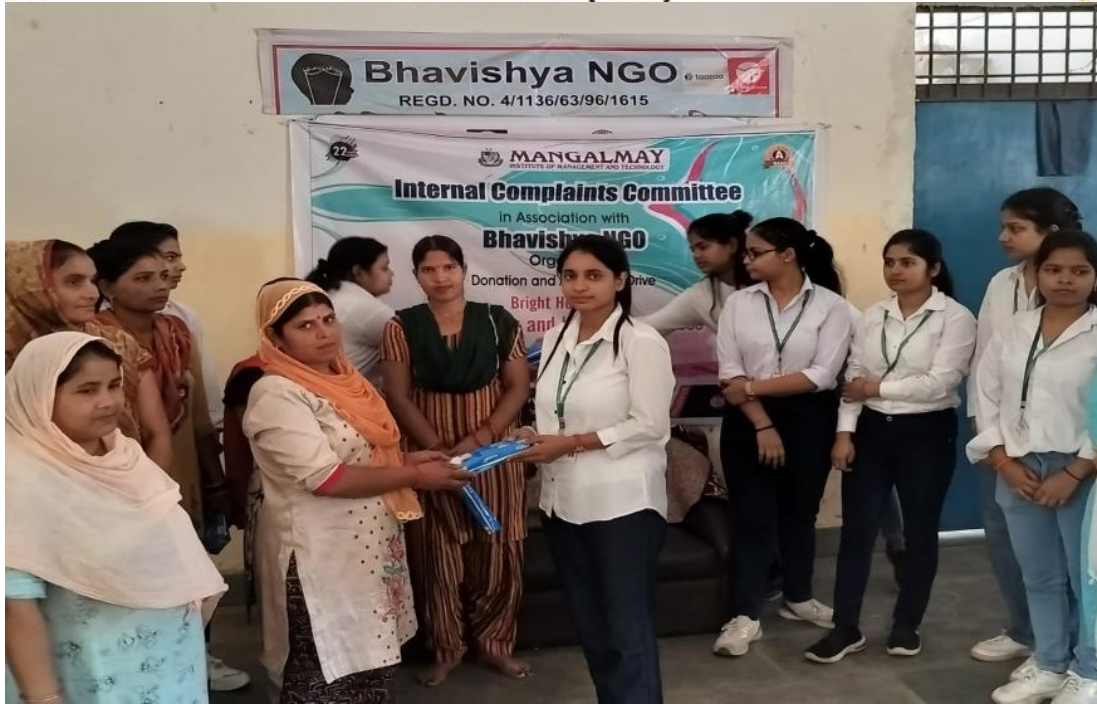
DISTRIBUTION OF SANITARY PAD TO WOMEN