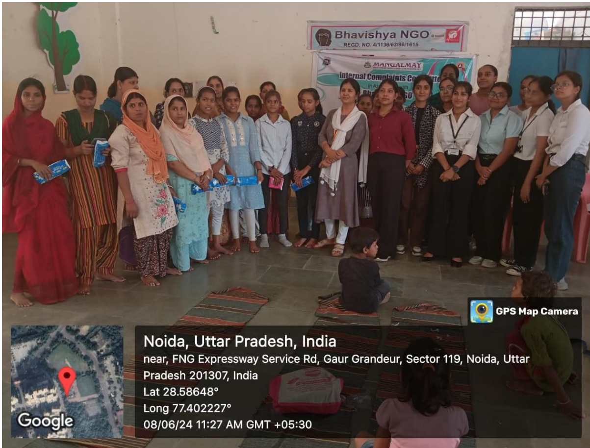
ADDRESS BY STUDENT TO WOMEN ABOUT SANITATION