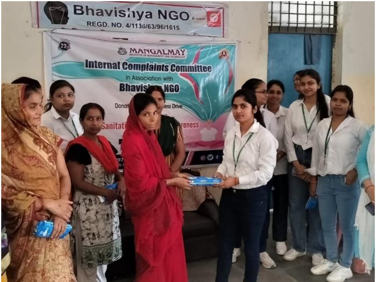
DISTRIBUTION OF SANITARY PAD TO WOMEN