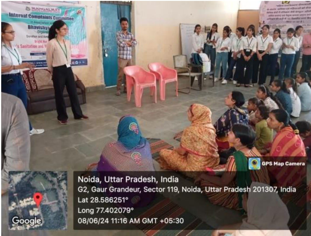
ADDRESS BY STUDENT TO WOMEN ABOUT SANITATION