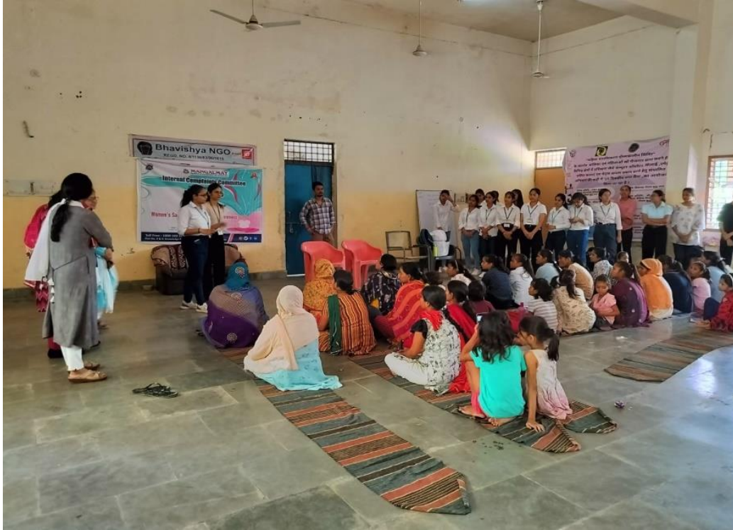
AWRENESS TO THE WOMEN