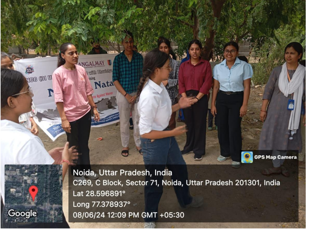
Nukkad Natak performed by Students