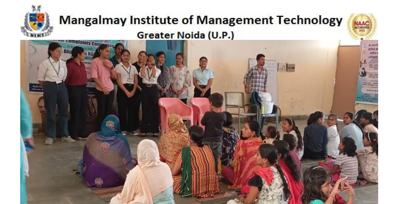
Address of Women by students