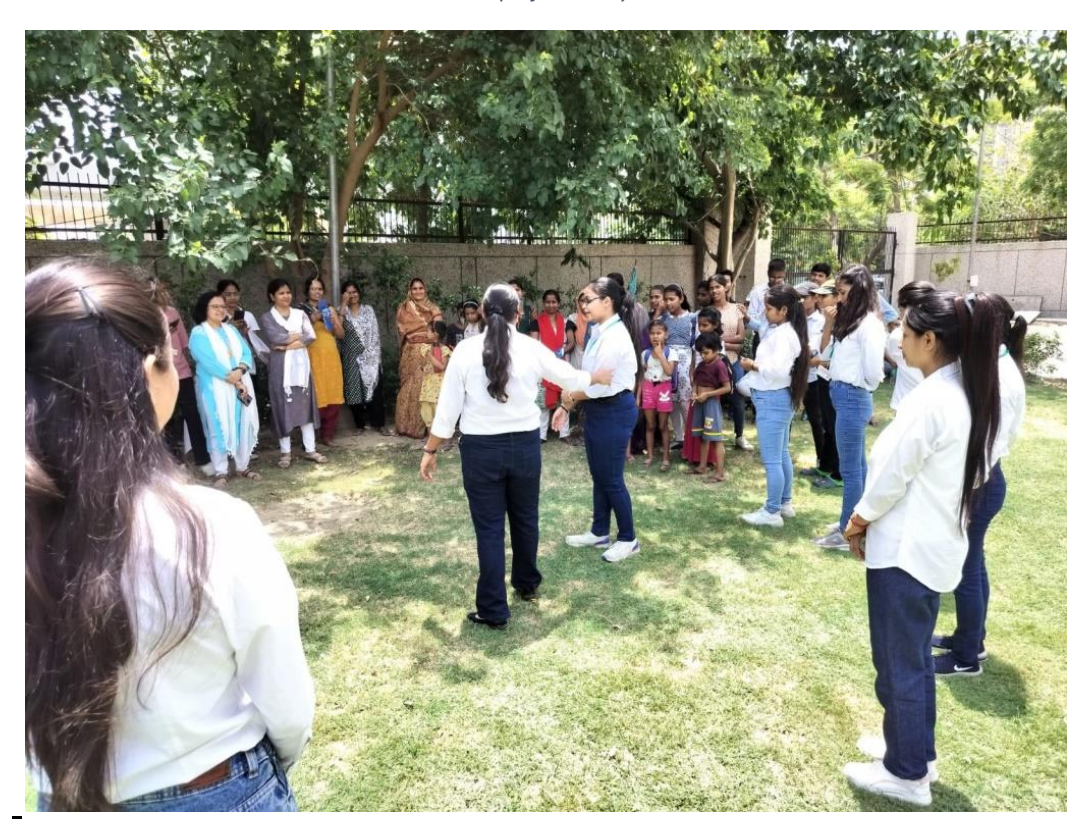
Students Perform Nukkad Natak