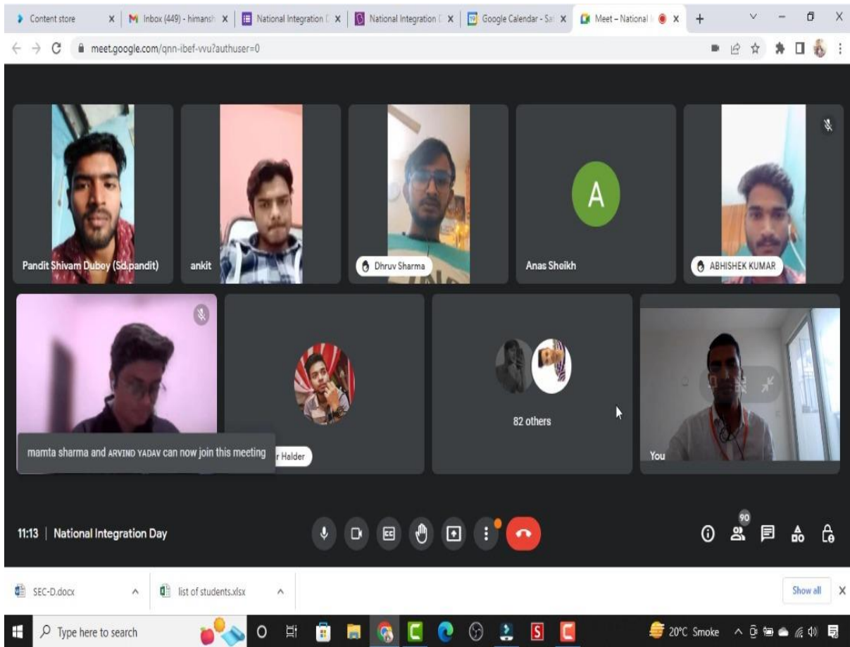
Figure 1 student of BCA participated in the activity