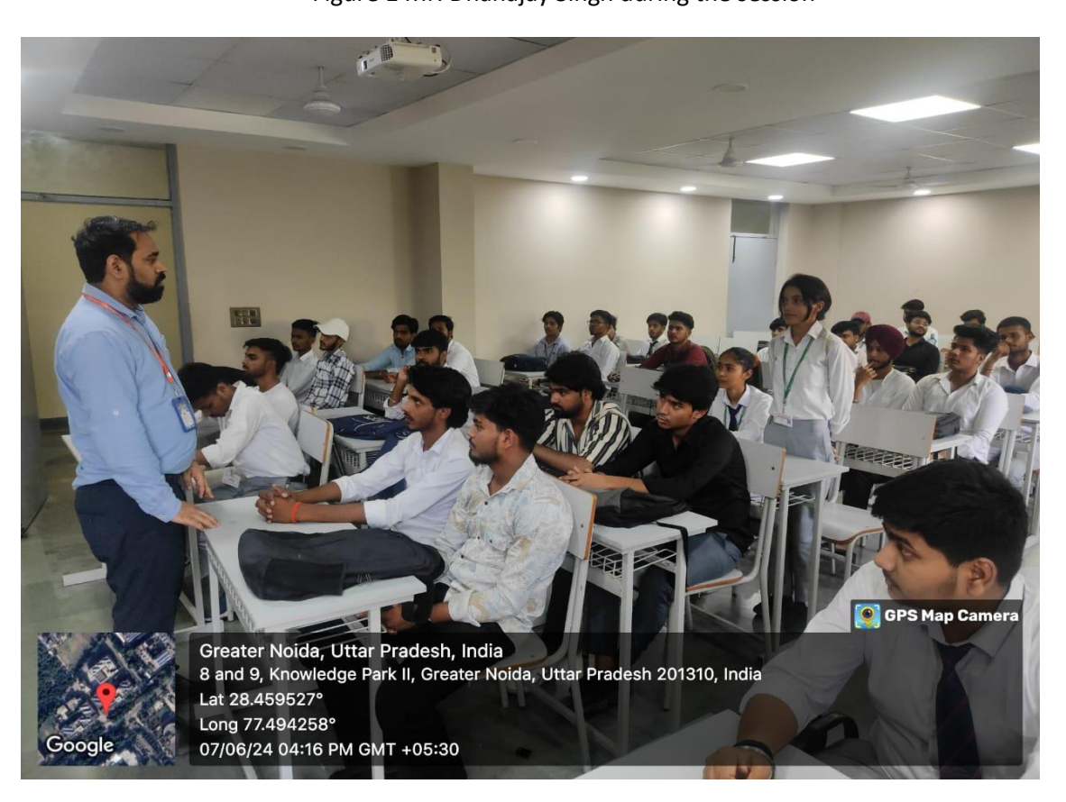
Figure 2 Student asking question