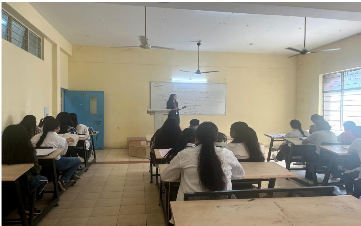
Pic 2: Students attentively listens to the session